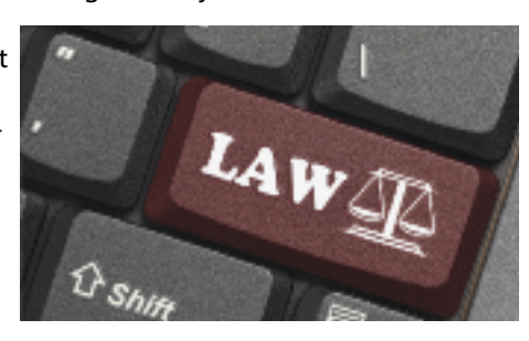
The use of technology must be part of a larger plan, so law firms can move all of their operations forward at the same time.

information resources has made finding client and firm information increasingly more difficult. To address that problem, improve efficiency and lower costs, the firm has invested in several knowledge management tools to make better use of firm-generated assets, such as pleadings,