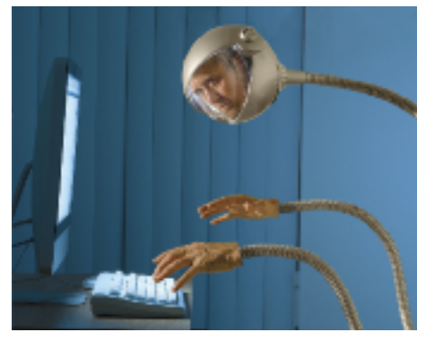
While technology is helping law firms serve their clients, there are still privacy and metadata issues that require advanced planning and "smart" policies.

for our lawyers, and will continue to augment our virtual capabilities and keep them secure. Our video systems are able to connect to clients over the Internet, giving us the ability to react quickly to client requests. We also provide enhanced mobility tools for smartphones and tablets to make it easier for attorneys to access client documents and information while traveling. Last year, we implemented a records efficien-